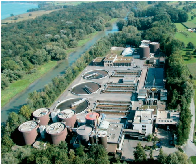
Beyond end-of-pipe solutions: There are alternatives to wastewater treatment plants for pollution control