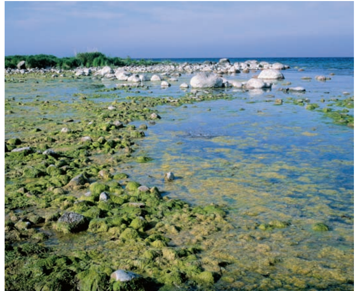
Green isn't always beneficial: The NoMix technology could rapidly help to resolve nutrient overload issues in coastal waters