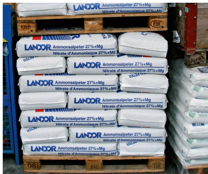
Problem or opportunity? Nutrients from urine are unwelcome in waterbodies, but useful as fertilizers

technology (Nova 2). Improved sanitary technology is, however, indispensable; although pilot projects can be carried out with today's NoMix toilets – larger-scale demonstration projects are not feasible (Nova PP). The objections raised by the sanitary industry will thus have a decisive influence on future developments.