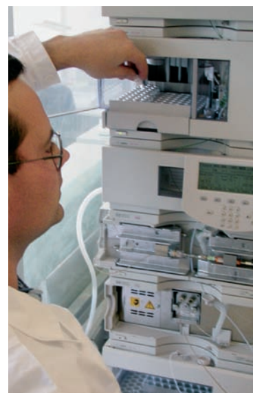
High tech in the lab: Samples are loaded for chromatography

in the Poseidon project for wastewater were to be adapted for the analysis of urine. However, control measurements indicated that this approach was unsuitable for this purpose. Using other methods from Nova 4-3, however, it was possible to measure individual substances [5].